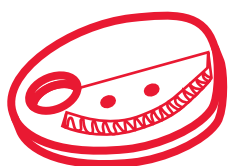
disc for cutting strips